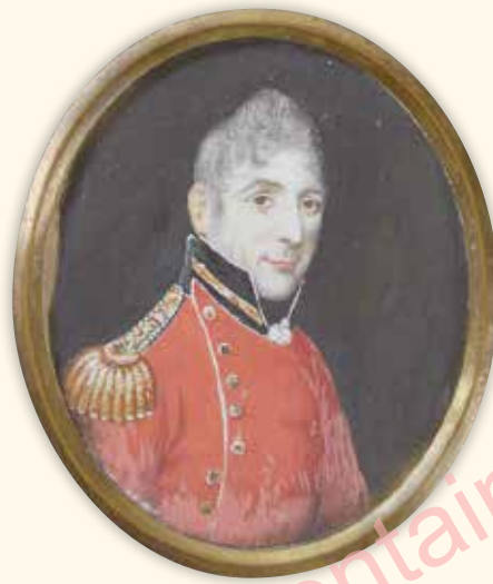
Governor Lachlan Macquarie – Mitchell Library, State Library of NSW