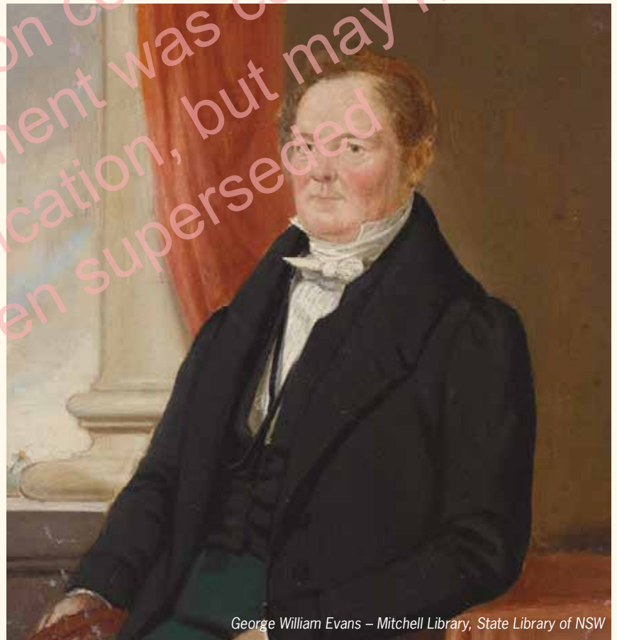
George William Evans

Evans made a significant decision, by determining to carry out the second part of his instructions first, i.e. by surveying beyond the Explorers' terminal point, which he did by starting at the foot of Mount York. Here he marked a tree on the 25th November 1813, and measured westward to his later selected objective at the Macquarie River, reaching there on 9th December 1813.