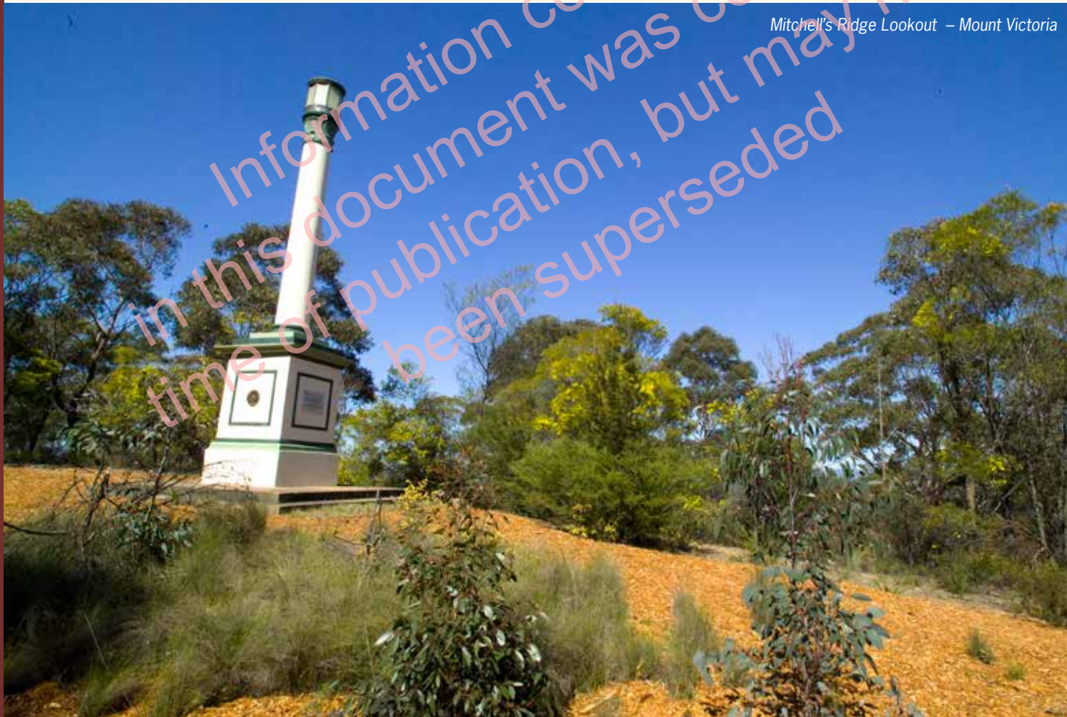
Mitchell’s Ridge Lookout – Mount Victoria

The survey would appear to have been carried out with a circumferenter, an advanced form of the magnetic compass and a Gunther’s chain and it can be accepted that this would be accurate to at least half a degree in angle and at least 1 in 1000 in the measurement of length. Based on this the points established by the modern methods would be within 100 to 150 feet (30 to 45 metres) overall, so individual spots would be much more closely defined.