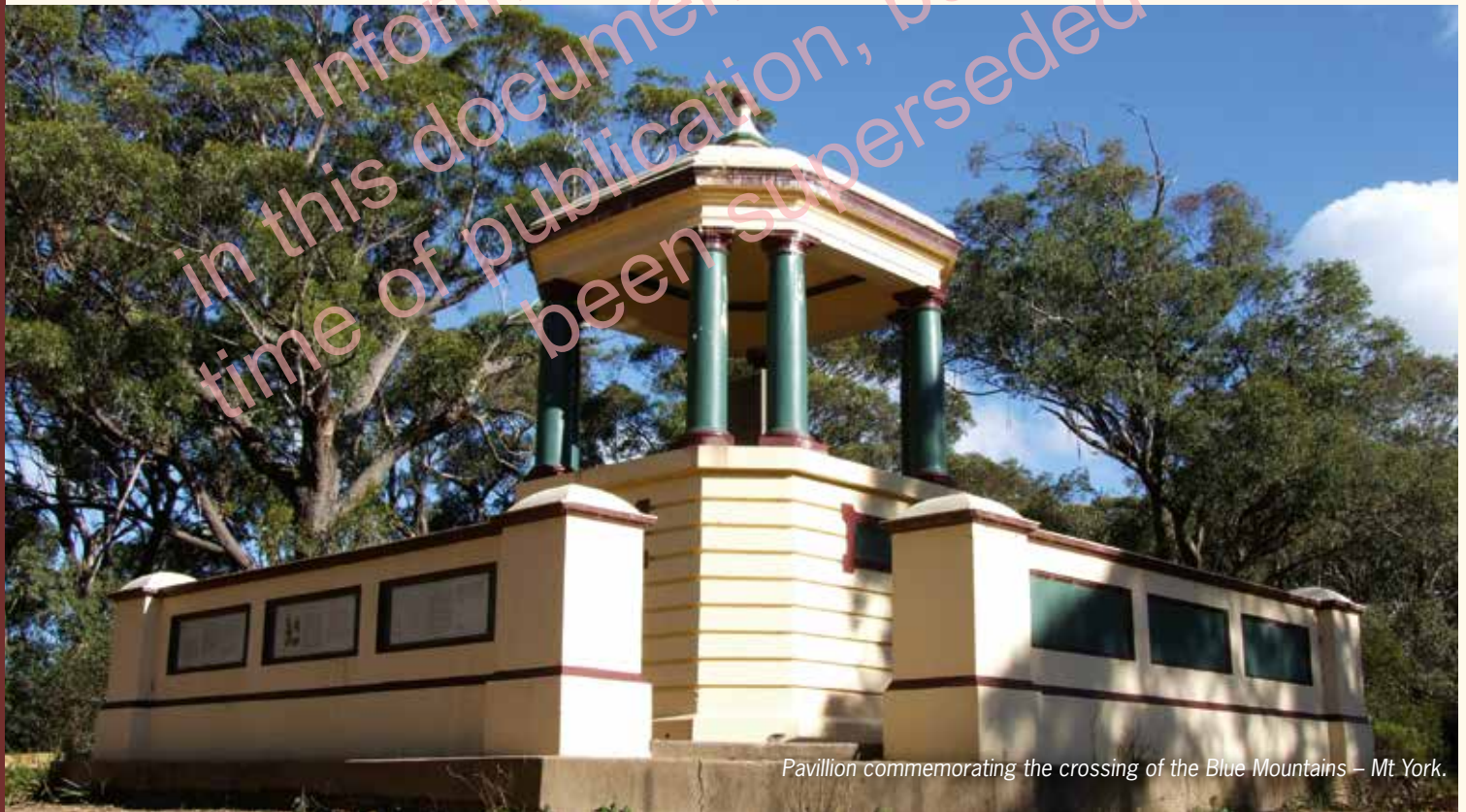
Pavillion commemorating the crossing of the Blue Mountains – Mt York.

While re-construction has brought about improvement in grade and alignment to the original route, one feels that those sections of the road that have been by-passed by modern day engineering should be preserved for future generations as a sample of what was done with hand tools, using manual labour without the back-up logistical resources of food, communication, and medicine, while facing the inclemency of winter weather, with its storms frost and snow, etc.