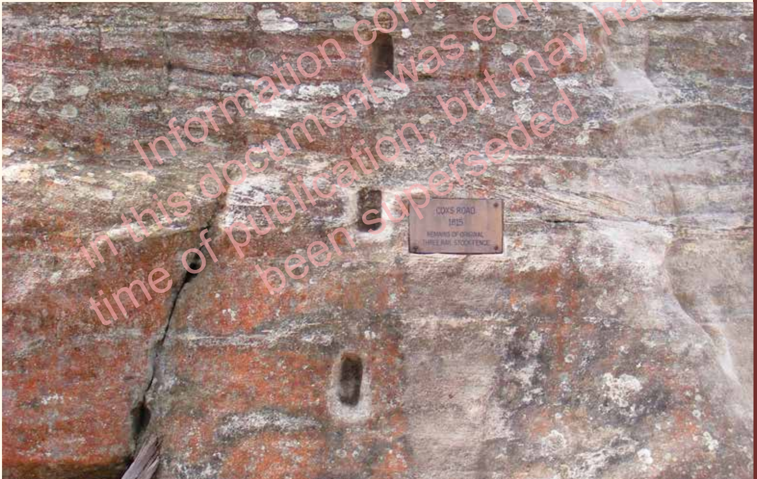
Cox's Road Mount York - remains of original tree rail stock fence

Randall T. who was evacuated to Windsor hospital on 26th September.