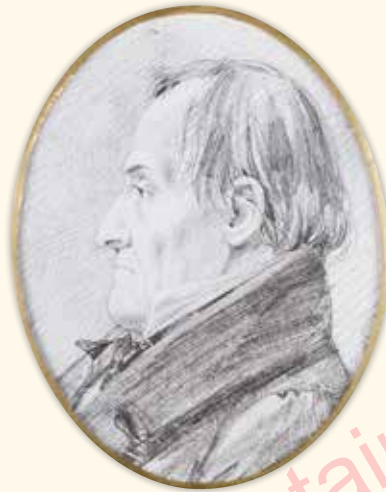
William Cox

William Cox (1764–1817), in charge, was a farmer from Clarendon, near Windsor, where he had settled after resigning from the NSW Corps. Cox had already done a great deal of road making throughout the County of Cumberland, when in July 1814, Macquarie made him Superintendent of the Works for a New Road over the Blue Mountains.