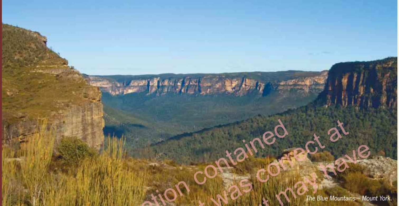
The Blue Mountains – Mount York.