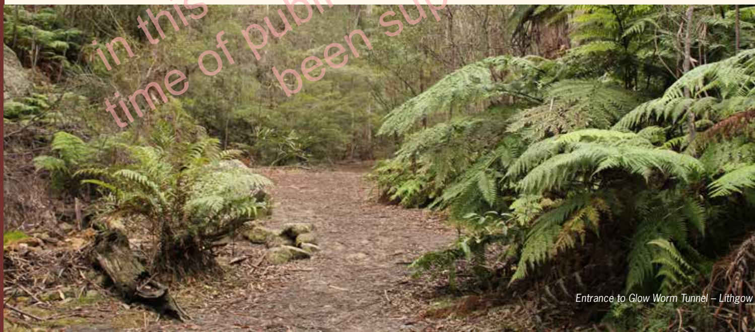
Entrance to Glow Worm Tunnel – Lithgow