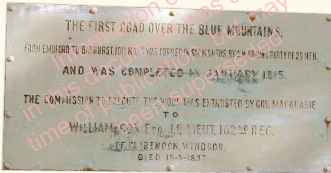
The First Road Over The Blue Mountains Memorial - Mt York

There were no further issues of blankets, although the diary frequently mentions that their blankets were wet and very uncomfortable, as they were sleeping under whatever shelter they could find, and it seems that tents were not provided for them.